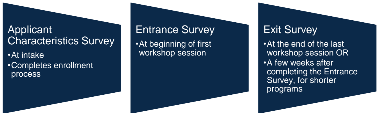
Exhibit 3. nFORM Survey Timing

All three of these surveys must be completed in nFORM, or in special scenarios, completed on paper and data entered into nFORM by a grantee staff member. Due to federal security requirements, grantees cannot reproduce the surveys in another system (e.g. SurveyMonkey) and transfer the data later.